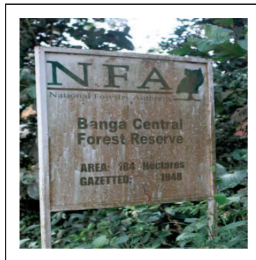
Plate 1. Forest reserve boundary marker, Bugala Island, Kalangala district.

During our visit to the island, we passed through areas where highly biodiverse, mid-altitude rainforest had been and was being cut down. At one point, across from a sign declaring the area part of a Central Forest Reserve (see Plate 1), a chainsaw was in action. At another point, we saw chainsaws being used alongside a huge regular saw to chop up the trees that had been felled. The forest area we passed through was much more biodiverse than the palm plantation. By comparison, individual palms in the relatively species-poor plantations were spaced about 5 m apart with little substorey vegetation cover. A narrow fringe of forest had been left beside the lake, but the scale of the plantation and associated