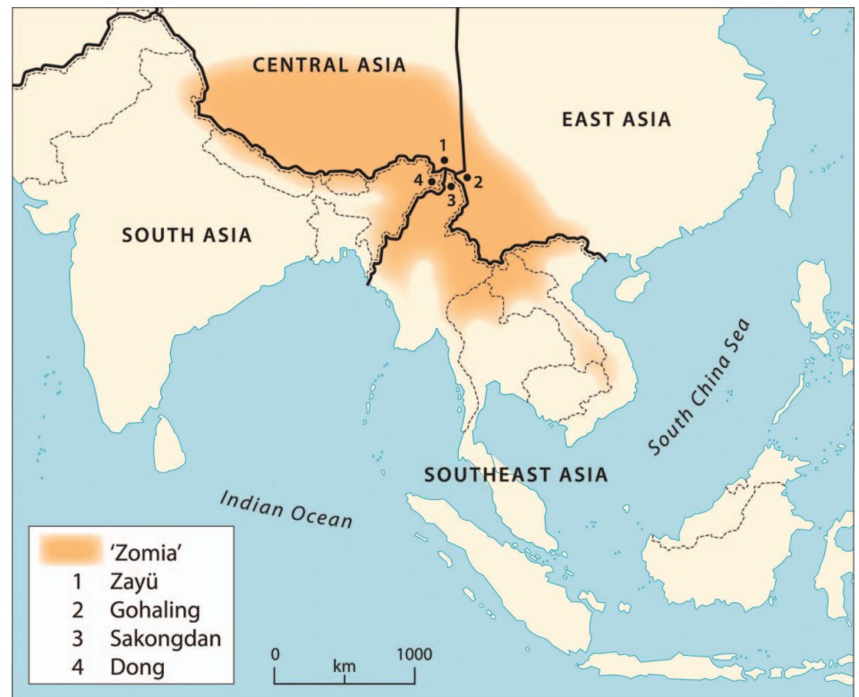
Figure 1. The intellectual partition of Zomia: Indicating four proximate towns assigned to different area specialisms. (Color figure available online.)

read it as one of the last places in the world to incorporate peoples into nation-states. Indeed, in the highlands of Burma, that process remains fraught. For Scott (2009):